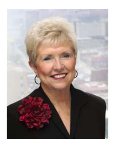
Mayor Kay Barnes City of Kansas City, Mo.