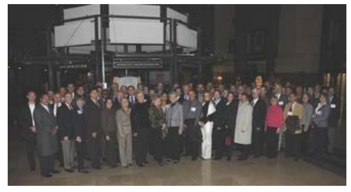
Participants at Reception at Union Station, Kansas City, MO

A clear interest springs from the private sector to recommend and participate with the public agencies in forwarding initiatives that respond to the challenges in demand, requirements in transportation capacity, and areas for improvement and development of transportation infrastructure projects in the region.