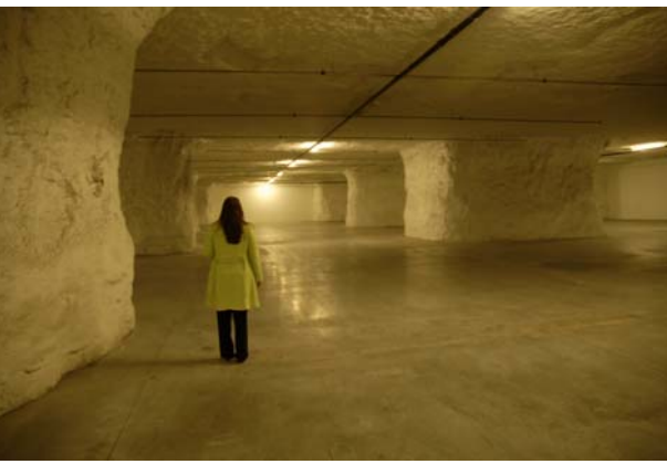
Hunt Midwest Sub Tropolis